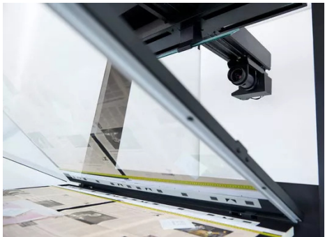
Toplight Table AT 0 with opened glass plate