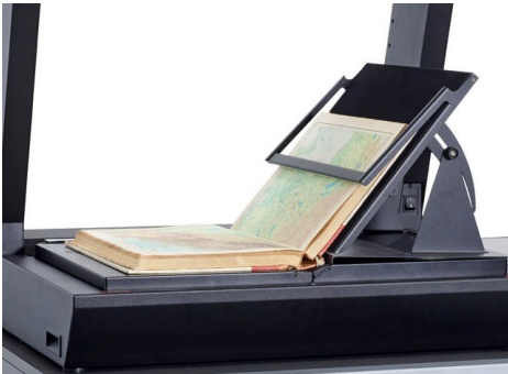
Bookholder on Copyboard OT 180 H 35 XL700